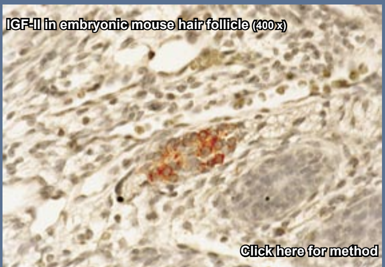
IGF-II in embryonic mouse hair follicle (400x)