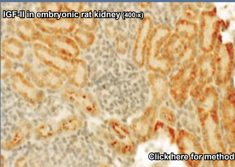
IGF-II in embryonic rat kidney (400x)